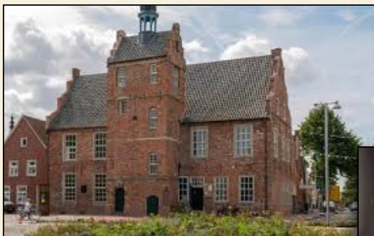
NORDEN TEA MUSEUM