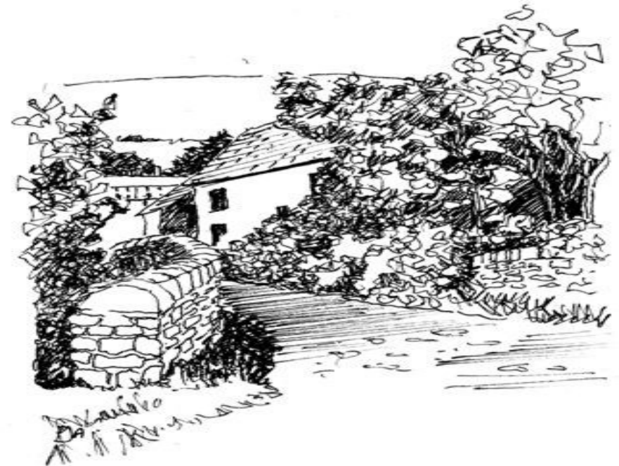
Pope's Farm House, Kingston Deverill